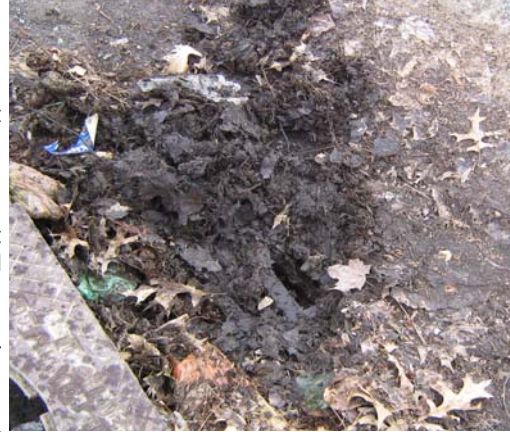
Street Drain Clogged with Leaves, Garbage and Sediment

For more information about improving our streams go to www.newalbanystormwater.org.