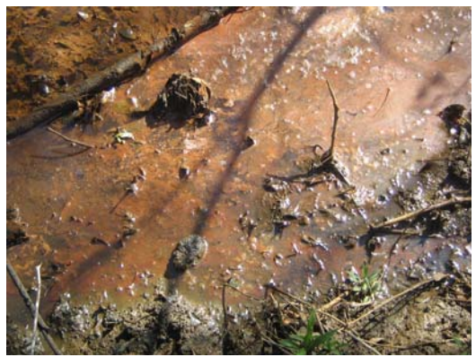
Leaves, Algae and Sediment in a Polluted