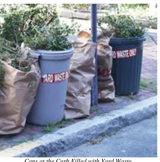
Cans at the Curb Filled with Yard Waste